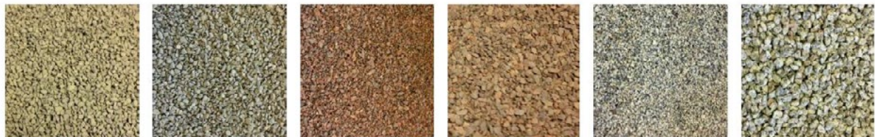
Green Basalt 1-3mm