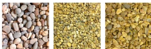
Brittany Bronze 6-10mm